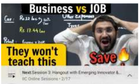
LINK FOR THIS VIDEO - https://youtu.be/ectBApUTvRc