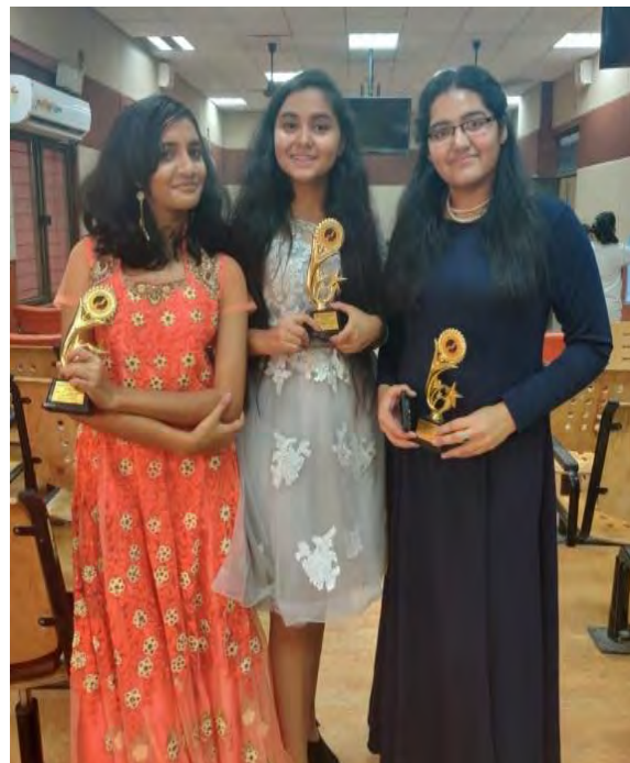
POETRY IN THE CLASSROOM – 24 th March 2020