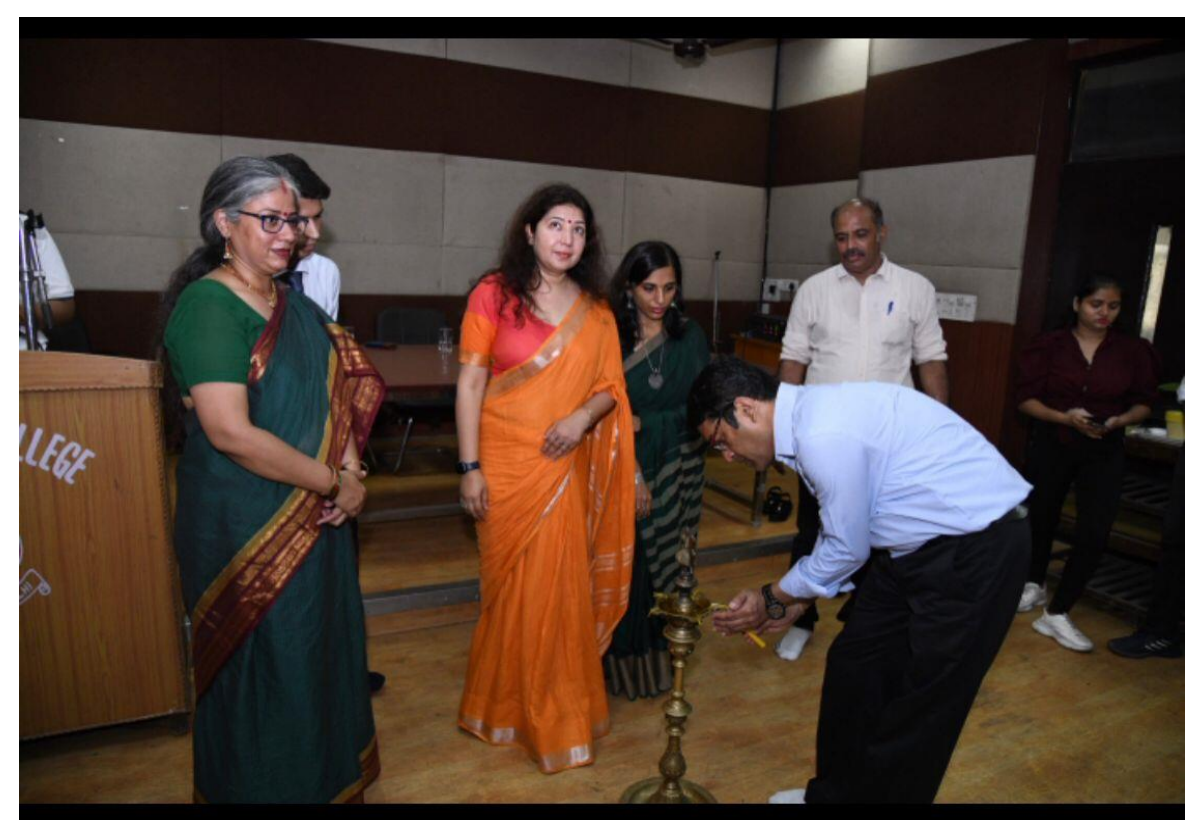
20th Jul, 2022: Seminar on Indian Knowledge System: A Way Forward in Higher Education