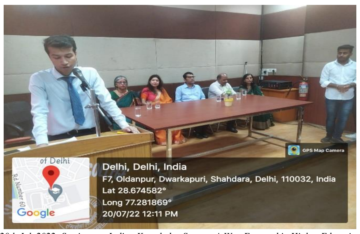
20th Jul, 2022: Seminar on Indian Knowledge System: A Way Forward in Higher Education