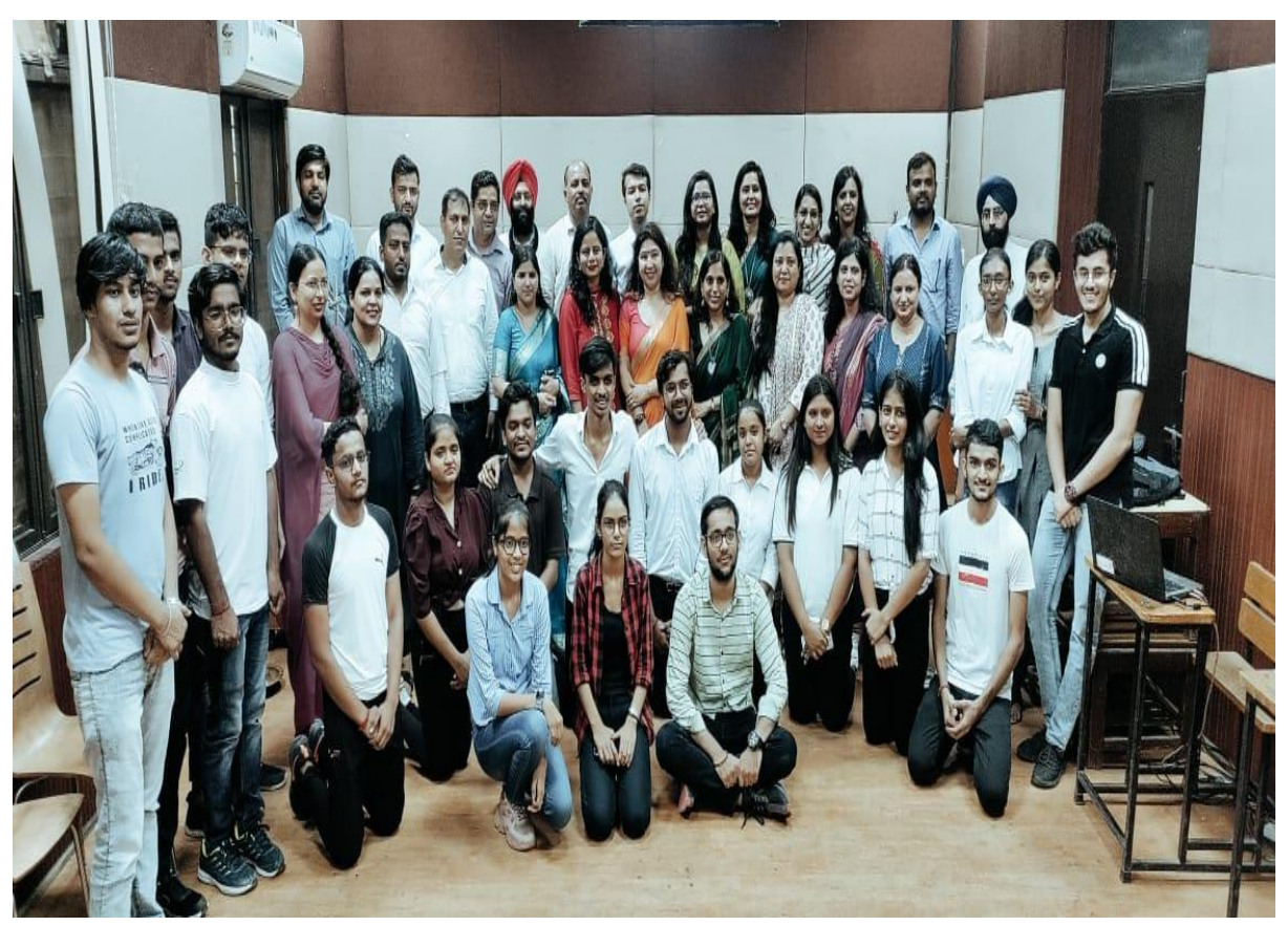
20th Jul, 2022: Seminar on Indian Knowledge System: A Way Forward in Higher Education