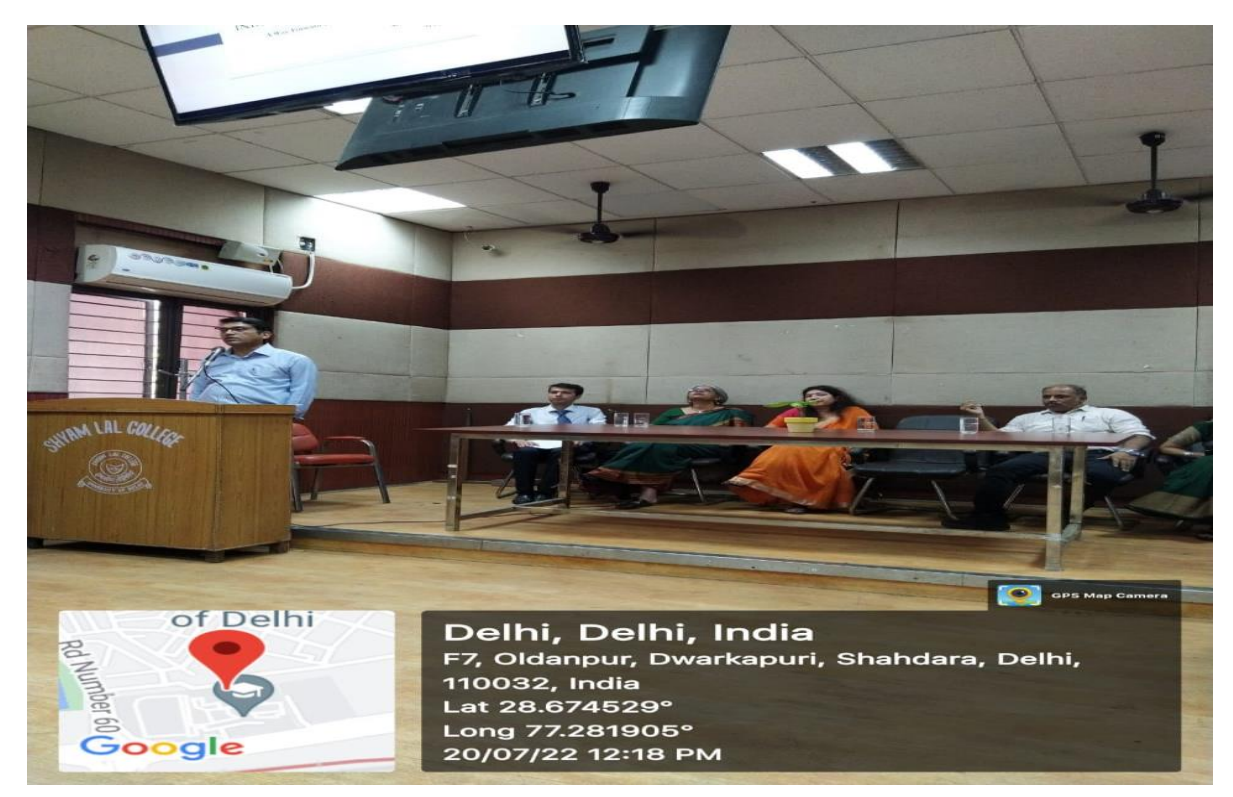
20th Jul, 2022: Seminar on Indian Knowledge System: A Way Forward in Higher Education