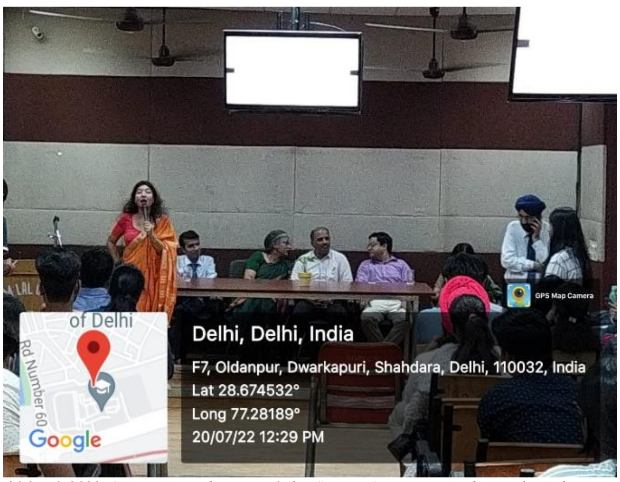
20th Jul, 2022: Seminar on Indian Knowledge System: A Way Forward in Higher Education