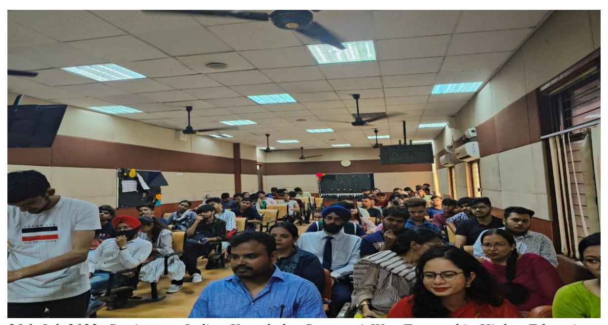
20th Jul, 2022: Seminar on Indian Knowledge System: A Way Forward in Higher Education