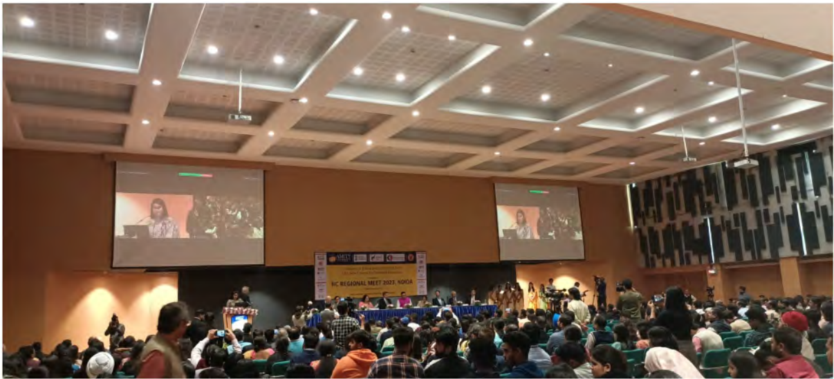
View at the Valedictory Ceremony of the event